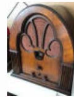
#2 Philco 70 very, very nice

The two raffle items offered at the 2023 VRPS Convention.