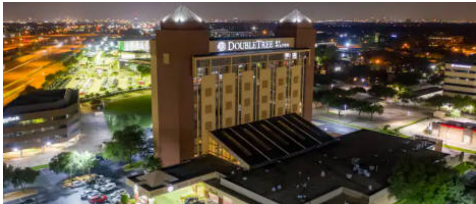
2023 VRPS Convention Hotel.