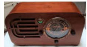
#1 AIR CASTLE 136 very nice