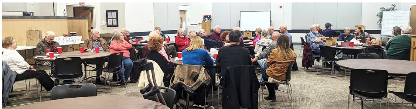
HLARA 2023 Christmas Party. No decorations this year, but we had fun.