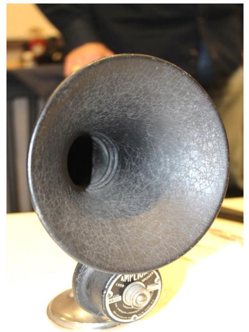
Figure 8 - Jim Collings' Amplion model AR19 "Dragon Fly" horn speaker.