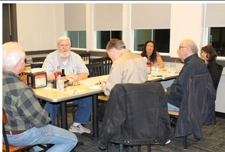
Figure 4 - It was a small group for the November meeting, but given the time of year and a new location, not a surprise.

WHAT HAPPENS AT THE CHRISTMAS PARTY STAYS AT THE CHRISTMAS PARTY