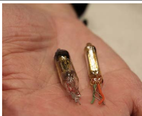
Figure 3 - Jim's C.'s tiny tubes, one with pins one with leads.

WHAT HAPPENS AT THE CHRISTMAS PARTY STAYS AT THE CHRISTMAS PARTY