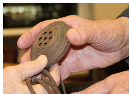
Figure 1 - Jerry's microphone.