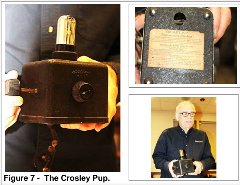
Figure 7 - The Crosley Pup.