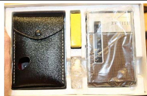
Figure 2 - Ray Cady's Zenith Pocket Transistor Radio.