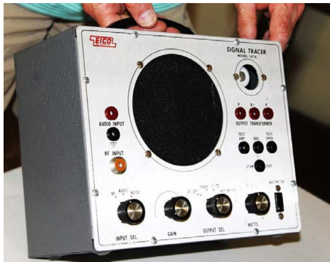
Jim Collings' Eico Signal Tracker Model 147A.