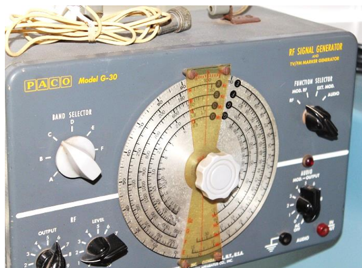
Jim Tyrrell's Paco G-30 signal generator.