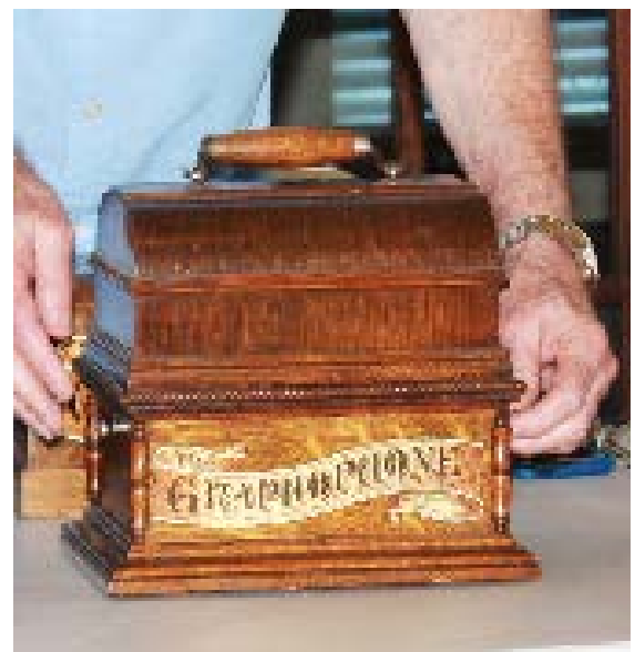
Figure 1: Jim's Columbia Model AA.

By 1910 disc machines were beginning to appear, and the cylinder's dominance was soon over. Edison made an internal horn cabinet model called the Ambrola from 1915 to 1921, an example of which Jim operated for us. It used a diamond