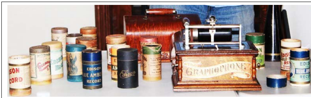
Figure 4: The cylinder collection that Jim brought in to share with us during his presentation.