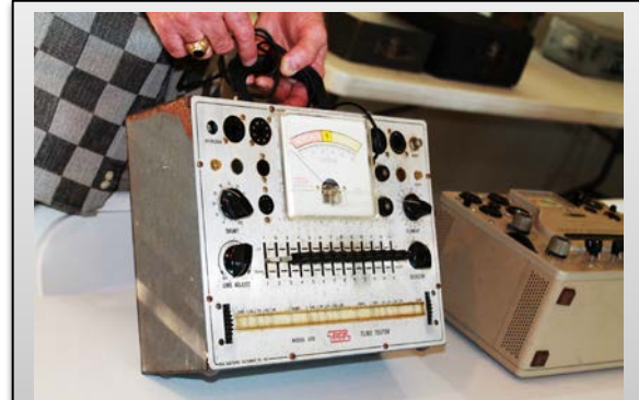
Figure 5: Jim Colling's TV-7, V model Tester.