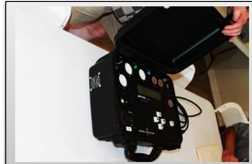
Figure 4: Jim Collings' Amplitrax AT 1000 Tube Tester.