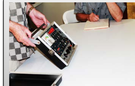
Figure 6: Jim Collings' EICO Tube Tester. An attachment can do CRTs.