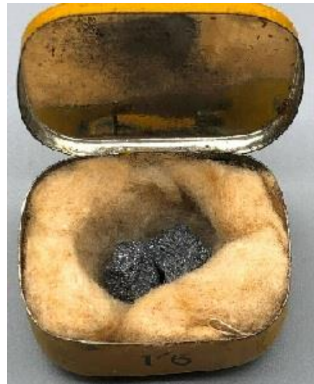
4) The inside of a Neutron Wireless Tin (found on Ebay 5/8/2020).

Interested in learning a bit more about the Galena Crystal? Check out this video: https://www.youtube.com/watch?v=YbEWO_RlgoXU .