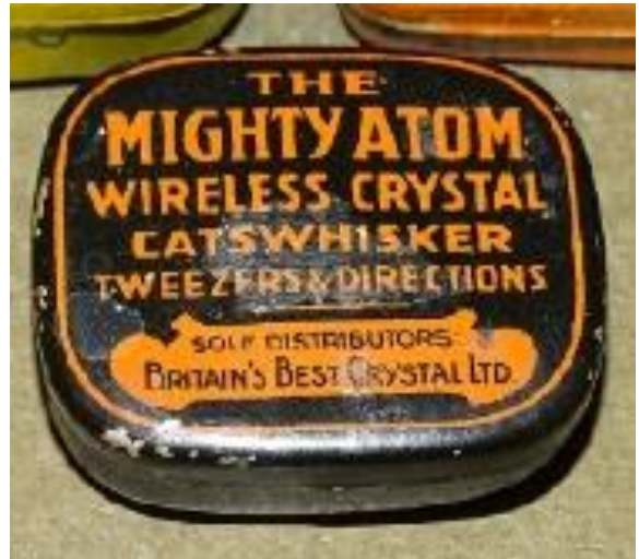
3) Closeup of Jim's Mighty Atom tin.

along with the crystal. I opened them all to find that four actually have cotton and a galena crystal (https://en.wikipedia.org/wiki/Galena), but no cat's whiskers. The Neutron included some original paperwork! These are fun items to collect, and not expensive. All of them came from radio swap meets at a cost of about $10 each.