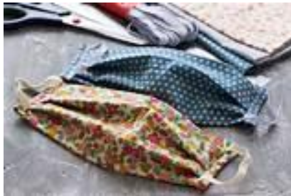
8)