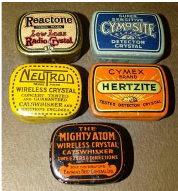
2) Featured British Crystal Radio tins Reactone, Cymosite, Neutron, Hertzite, and Mighty Atom.

In Great Britain radio sets were taxed by the BBC, based on the number of tubes in the set. So a radio set with no tubes probably had the lowest tax, making the life of crystal sets much longer than here in the US, where after the 1920's they were mainly novelty items. Remember distances between stations are much closer in Europe, so they could be effective receivers. These are all roughly the same size, about 1¾ inches in length. They are the same size as phonograph needle tins that held 300 needles, which were also sold into the 1950's. The brands featured are: Reactone, Cymosite, Neutron, Hertzite, and Mighty Atom. Some included a cat's whisker (https://www.electronics-notes.com/articles/history/radio-receivers/cats-whisker-crystal-types.php)